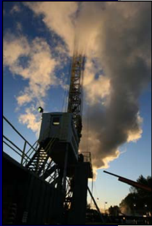
Rig 105 Thermal Single, running first hot liner.