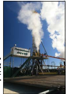
Rig 105, Running Hot Liner

Thank you to our rig crews for all their hard work!